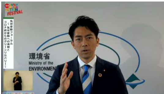
Environment Minister Shinjiro Koizumi