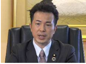
Takashi Uto State Minister for Foreign Affairs of Japan