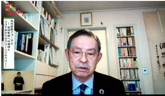
Takejiro Sueyoshi , Representative of Japan Climate Initiative

The coming five to 10 years are crucially important for Japan to achieve carbon neutrality by 2050. Not only technological innovation but also rules-related innovation is necessary. Japan will strive to promote the use of renewable energy, curtail disposable plastic products, and develop a circular economy by encouraging carbon pricing, amending the law to promote anti-global warming measures, and establishing a new legal framework on the use of plastics.