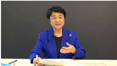
Chiaki Mukai, Doctor/astronaut