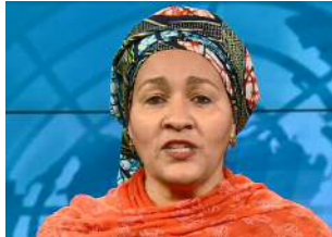
Amina J. Mohammed United Nations Deputy Secretary-General