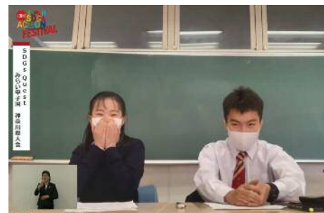
Transition Seminar Association

The idea is designed for people to take part in a Paralympic sports experimental session, developed to eradicate the general public’s discrimination and prejudice towards disabled people. The plan is also meant to solve gender issues by having women and other socially vulnerable people experience para sports. With the expansion of the sports market for disabled people through this idea, new employment will be created and work motivation can be enhanced, leading to the expansion of the leisure market.