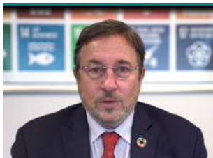
Achim Steiner United Nations Development Programme Administrator