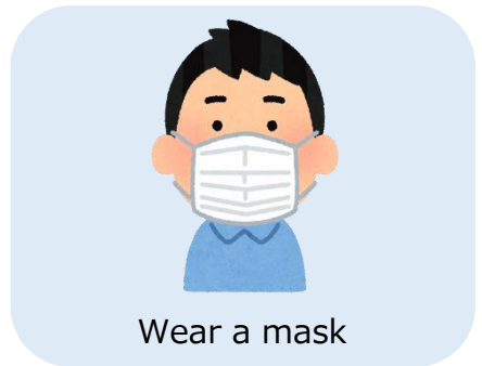
Wear a mask