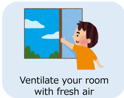
Ventilate your room with fresh air