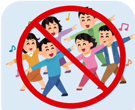
Avoid gathering as a crowd