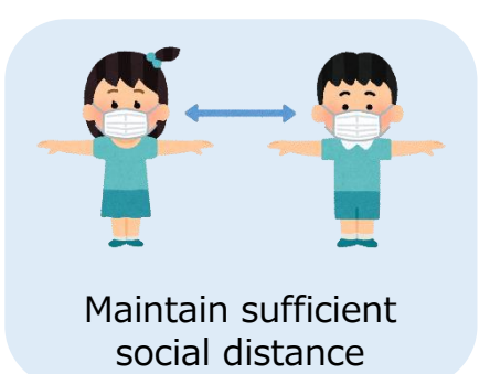
Maintain sufficient social distance