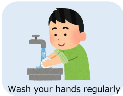
Wash your hands regularly