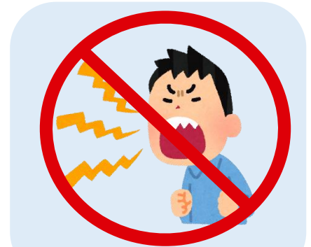
Refrain from speaking loudly