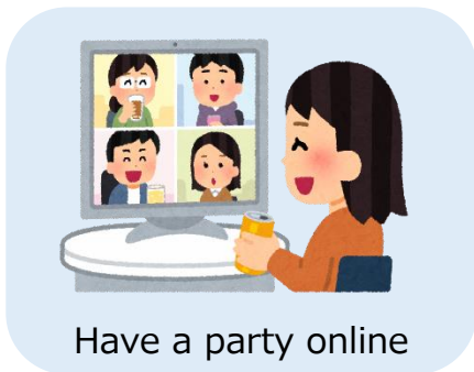
Have a party online