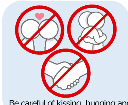
Be careful of kissing, hugging and shaking hands! They are risky!