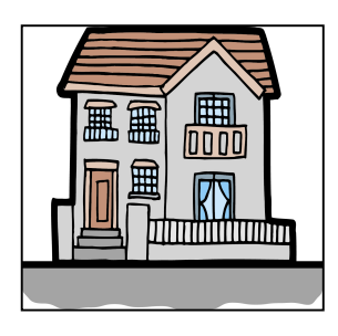
Kodate Jutaku A single family house or a detached house