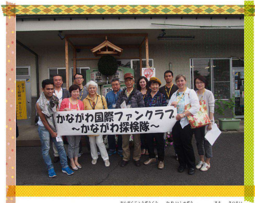
おんがくじょうぞうくら かねいしゅぞう まえ さつえい 音楽醸造蔵 金井酒造さんの前で撮影

Kanagawa Expedition offers opportunities for KANAFAN members to see tourist spots and facilities so that they can directly experience the charms of Kanagawa. This time, 12 members set off on a trip on the theme of classical music and Japanese sake. KANAFAN members from China, Germany, Nepal, Mexico and Spain joined the tour with Japanese supporting members.