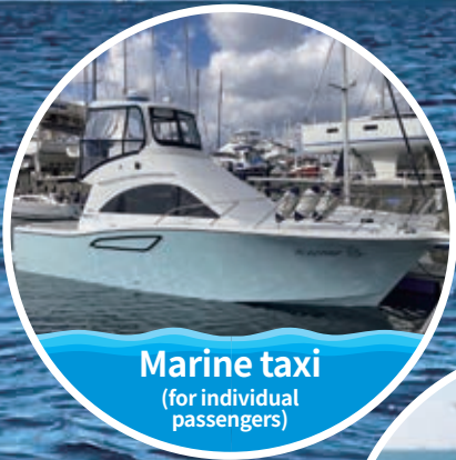
Marine taxi (for individual passengers)