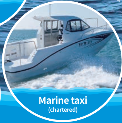
Marine taxi (chartered)