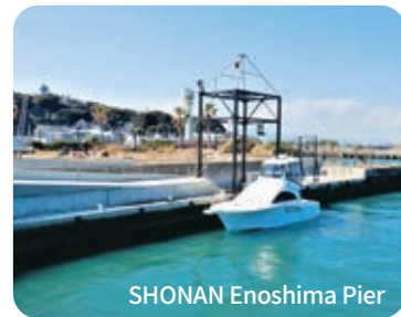
SHONAN Enoshima Pier