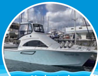
Marine taxi (for individual passengers)