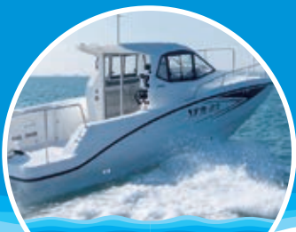
Marine taxi (chartered)