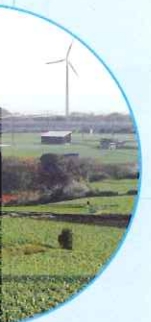
Hayagawa Park の風車