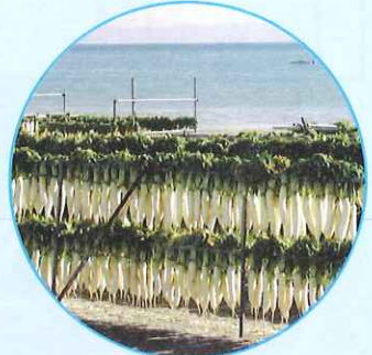
Radish drying on Miura Beach 三浦海岸のだいこん浜干し