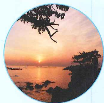
Sunset at Morito Beach 森戸の夕照 MAP E-6