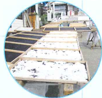
Boiled whitebait at Koshigoe 腰越のしらす MAP A-4