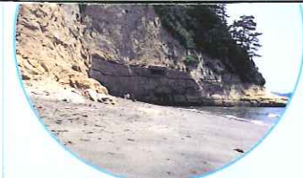
Inamuragasaki 稲村ヶ崎 MAP C-5