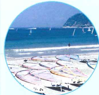
Windsurfing at Zushi Beach 逗子海岸のボードセイリング MAP E-5