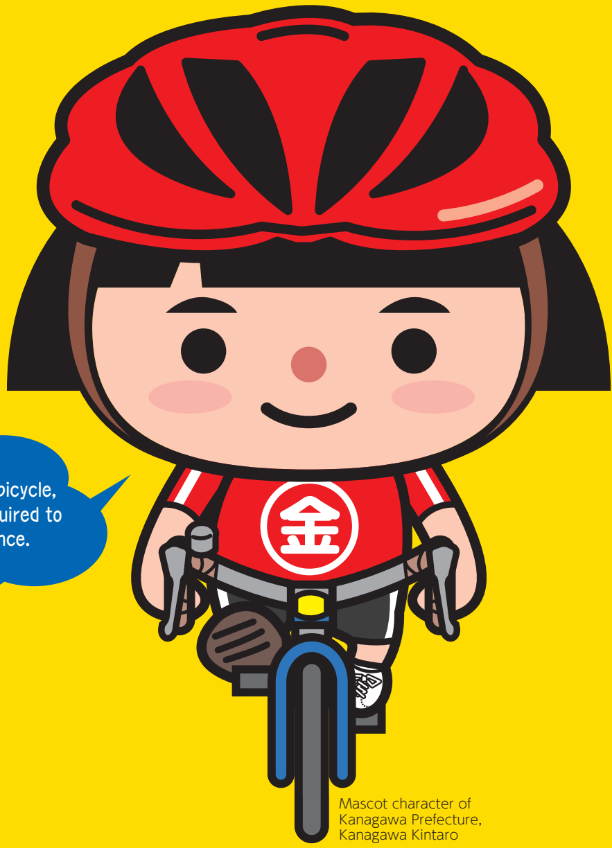
Mascot character of Kanagawa Prefecture, Kanagawa Kintaro

If a child rides a bicycle, parent will be required to obtain the insurance.